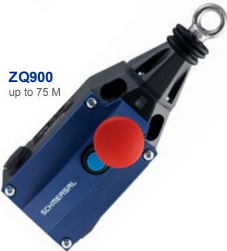
ZQ900 up to 75 M

The compact ZQ700 is capable of spanning lengths of up to 10 meters. The rugged ZQ900 is capable of spanning lengths of up to 75 meters and features an optional integrated E-Stop pushbutton. The T3Z068 is a heavy duty bidirectional model, allowing for 50 M in both directions and has either a pull ring or keyed reset.