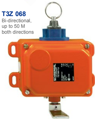
T3Z 068 Bi-directional, up to 50 M both directions