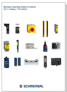
GK-1 Machine Guarding Safety Products Catalog Section 2