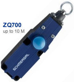
ZQ700 up to 10 M