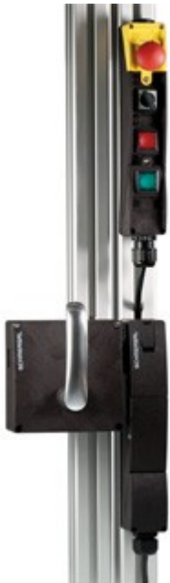
BDF200 fits standard housing extrusions and aesthetically matches our AZM200.