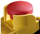
NHK Collared E-Stop Operator for position 1