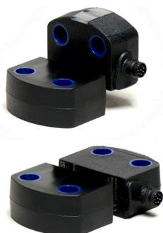
2 actuator approach directions