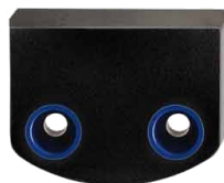
RST-260-1 (39 mm x 29.5 mm x 18 mm)