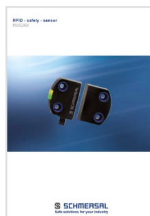
RSS260 Brochure 4 pages