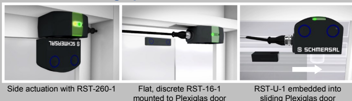
Side actuation with RST-260-1